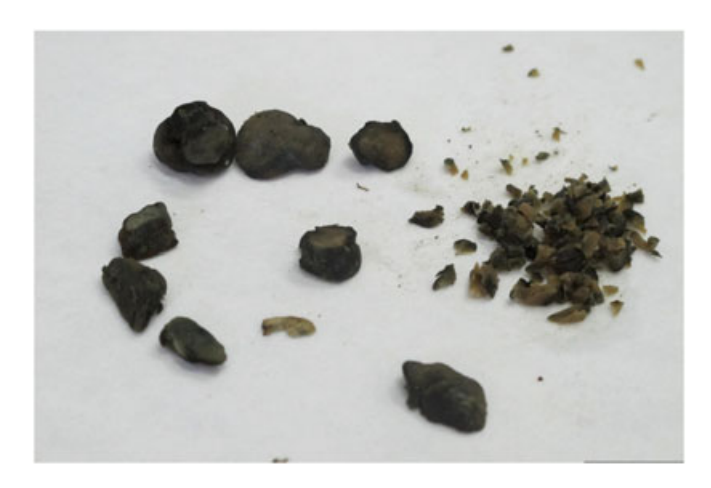
Figure 1. Sclerotia (or truffles) seized by the Italian anti-adulteration and safety bureau police.

Powder standards (99% purity as reported in the manufacturer certificates) of psilocybin, psilocin and 4-hydroxy N,N-